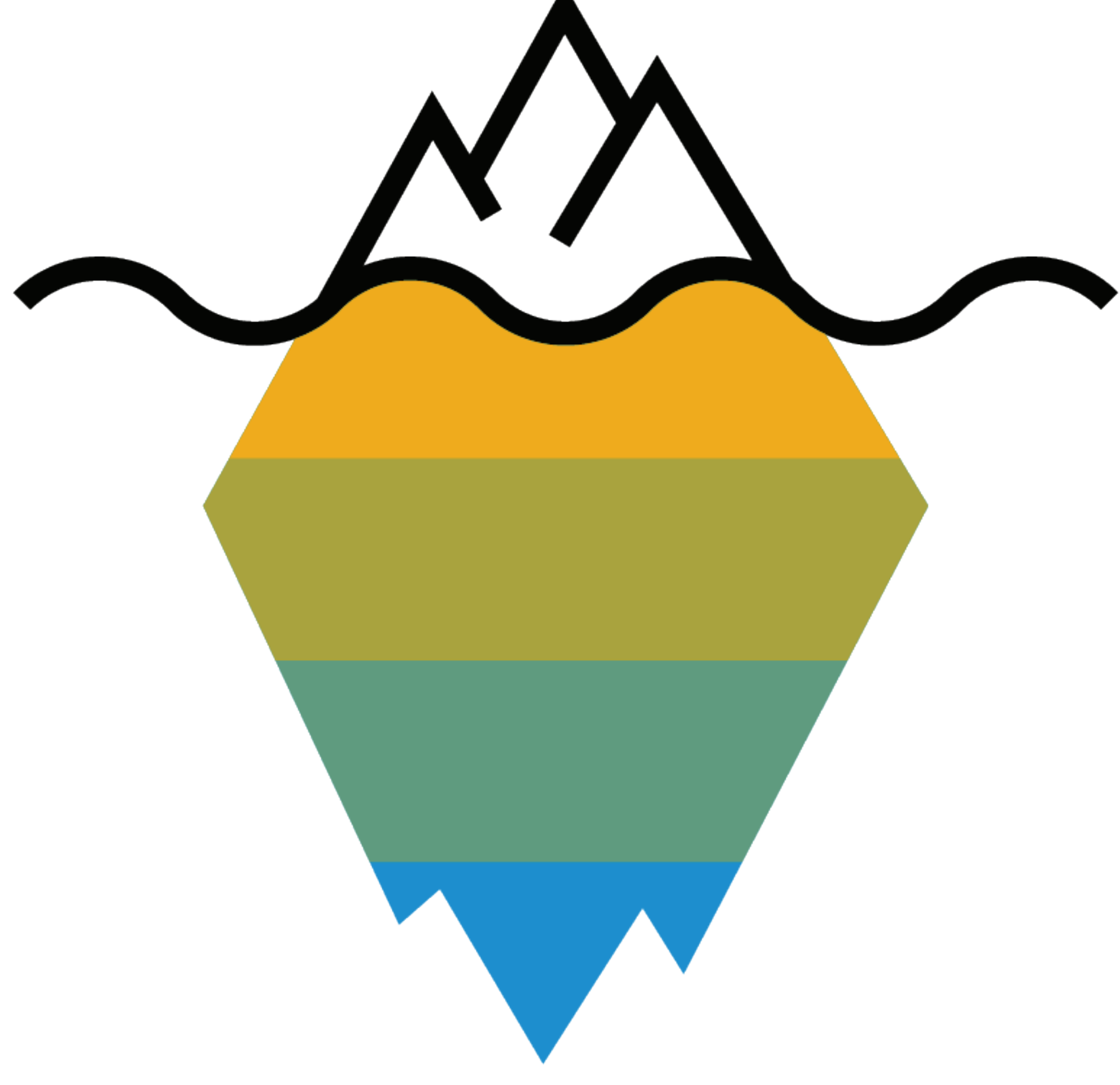
Current UDI Guidelines are Just the Tip of the Iceberg